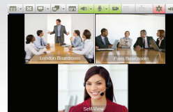
Multi-participant video conference

A multi-participant video conference may occur in your personal online meeting place attached to your account or in someone else's online meeting place